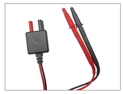
SA163: photovoltaic adapter

Supplied with: test leads, manual, thermocouple K (ST305), batteries and carrying bag. Optional accessories :